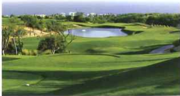
Cabo Real Golf Course

Mexican roots in every imaginable detail, from its incorporation of Mexican elements in the architectural design to the use of local materials and stone. Artwork fills the hotel, including beautiful bronze sculptures that adorn the lobby and restaurants and original paintings that can be found in every guest suite.