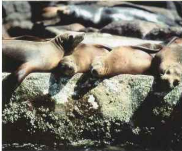
From top to bottom: The lobby at Marquis Los Cabos; a view of Esperanza resort, and Cabo San Lucas' resident sea lions.

There, you can snorkel among the schools of fish that crowd the reefs or walk across the peninsula to what's been dubbed Divorce Beach, thanks to rough, treacherous waters. Get behind the wheel of a rugged all-terrain vehicle for a wild ride through the desert. Book a tee time at Cabo del Sol's Jack Nicklaus-designed ocean course, deemed the best in Mexico. Or sign up for a treatment at luxurious spas that abound along the resort corridor.