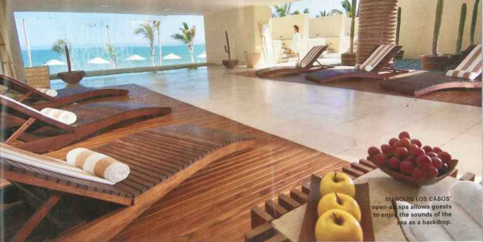
MARQUIS LOS CABOS' open-air spa allows guests to enjoy the sounds of the sea as a backdrop.