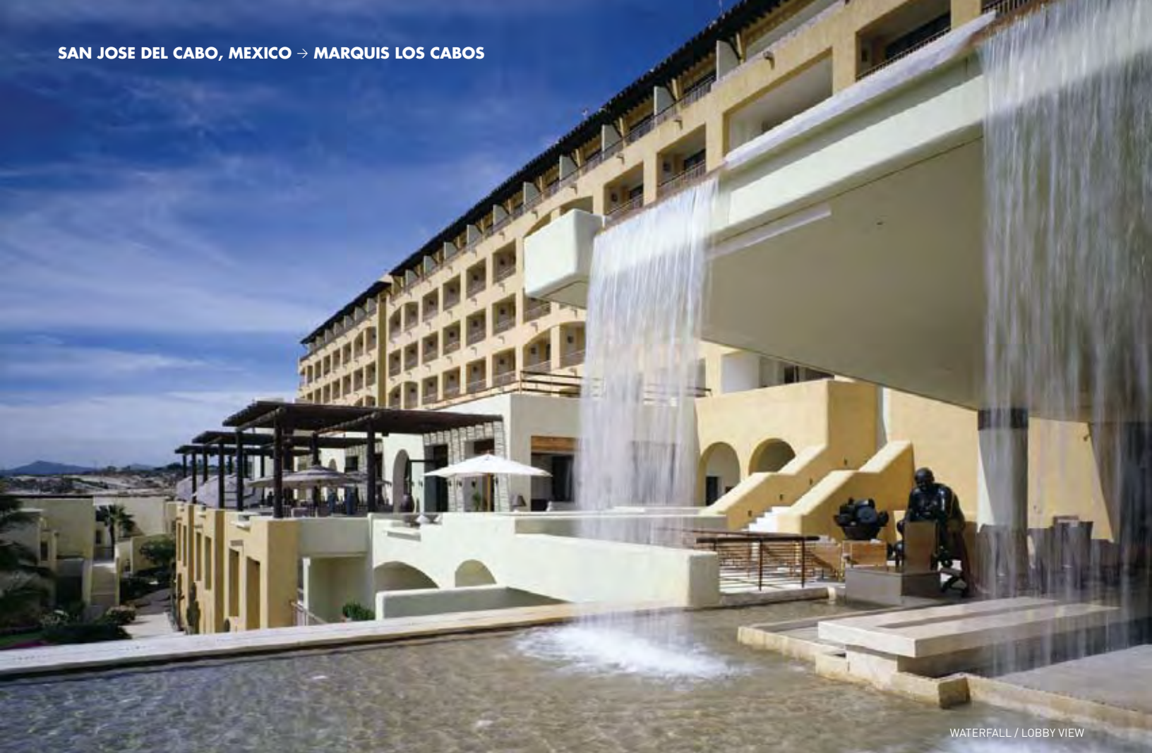
WATERFALL / LOBBY VIEW