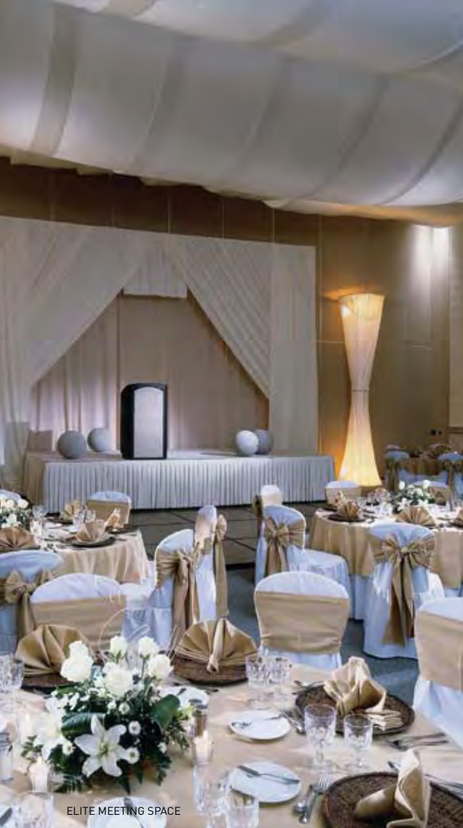
ELITE MEETING SPACE