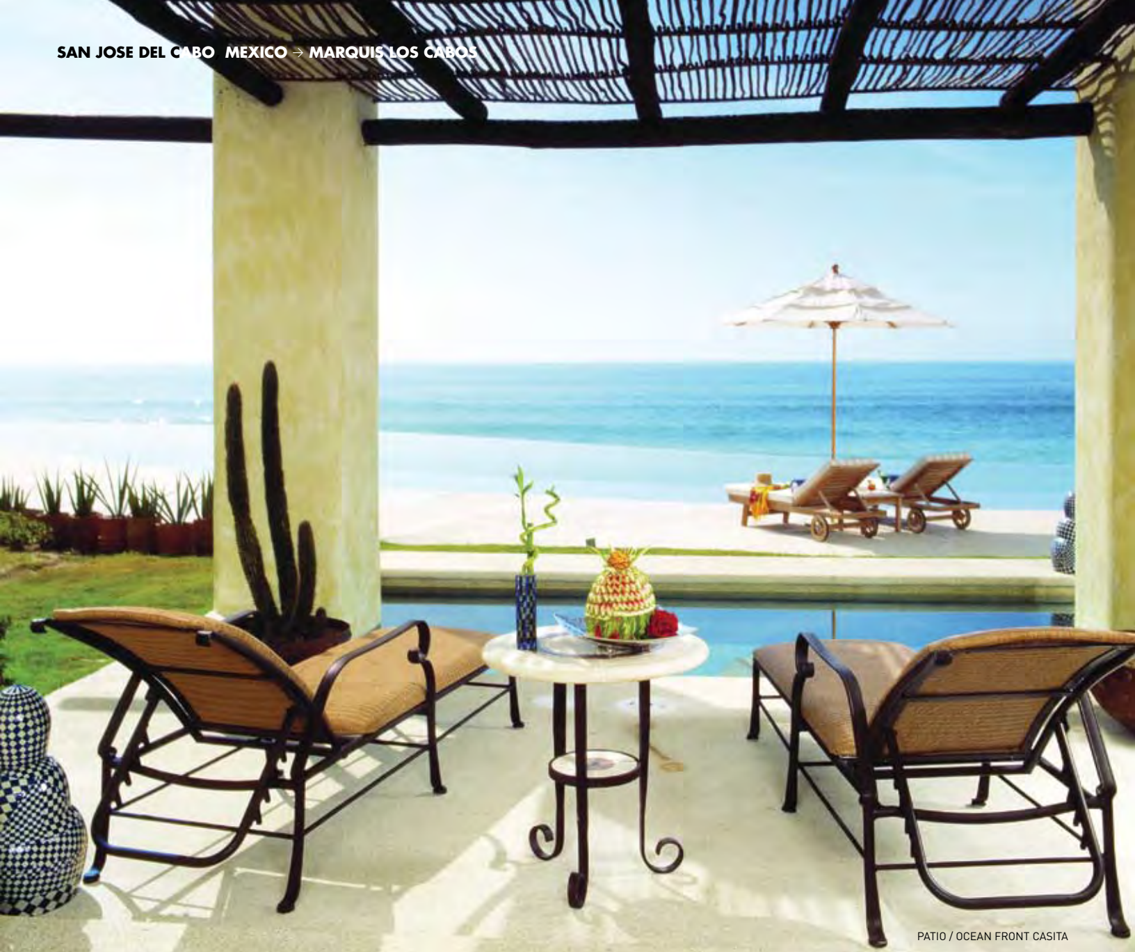
PATIO / OCEAN FRONT CASITA