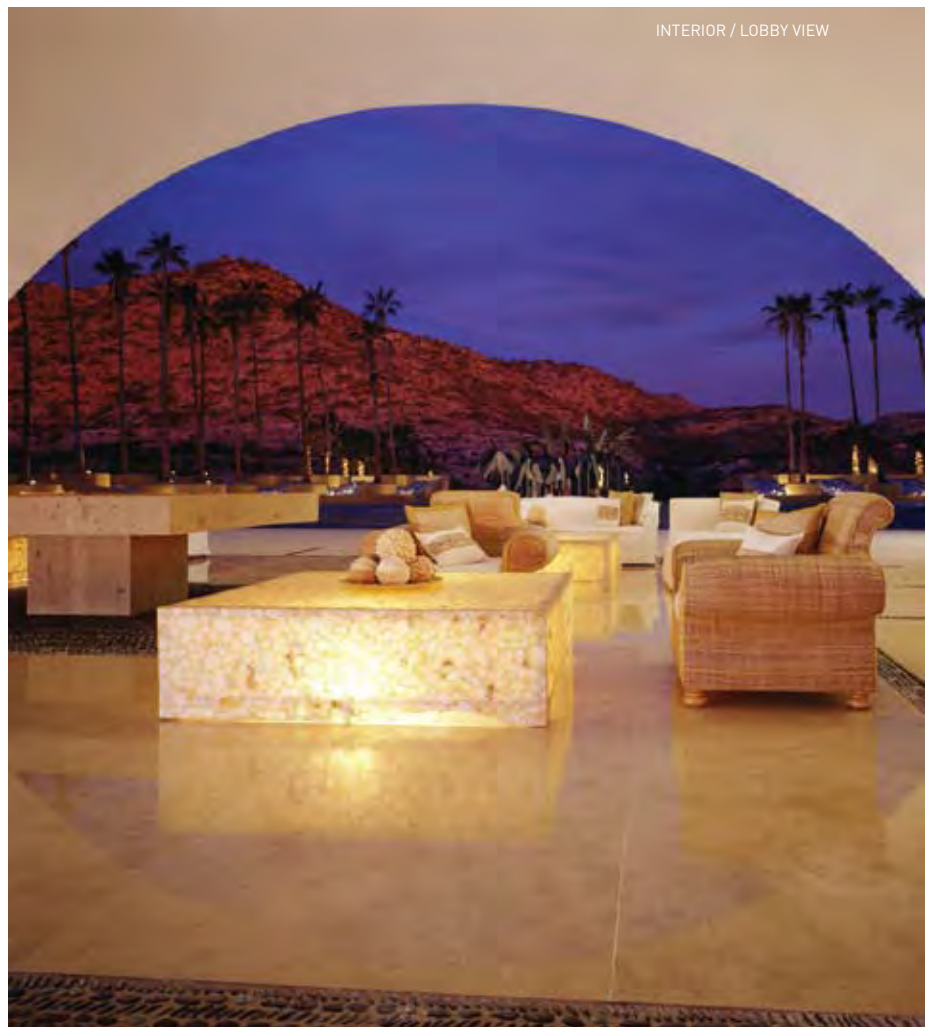
INTERIOR / LOBBY VIEW